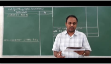
Figure 2: The cash conversion cycle