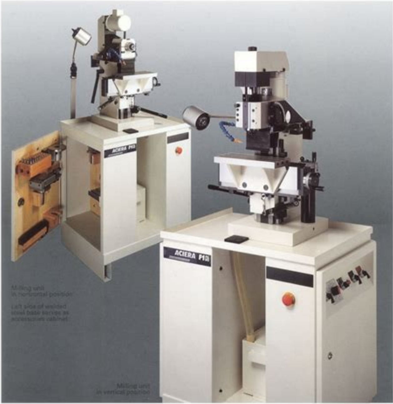
Universal precision milling machine

The small ACIERA universal milling machines have long been setting the standard in the world of micro-mechanics. They are particularly well adapted for operations requiring a high degree of precision and manoeuvrability: horological products, electronics, jewellery, optics, the manufacture of tools, moulds, small dies, electrodes and dental instruments. The machine's production possibilities are greatly enhanced by a wide range of equipment and accessories.