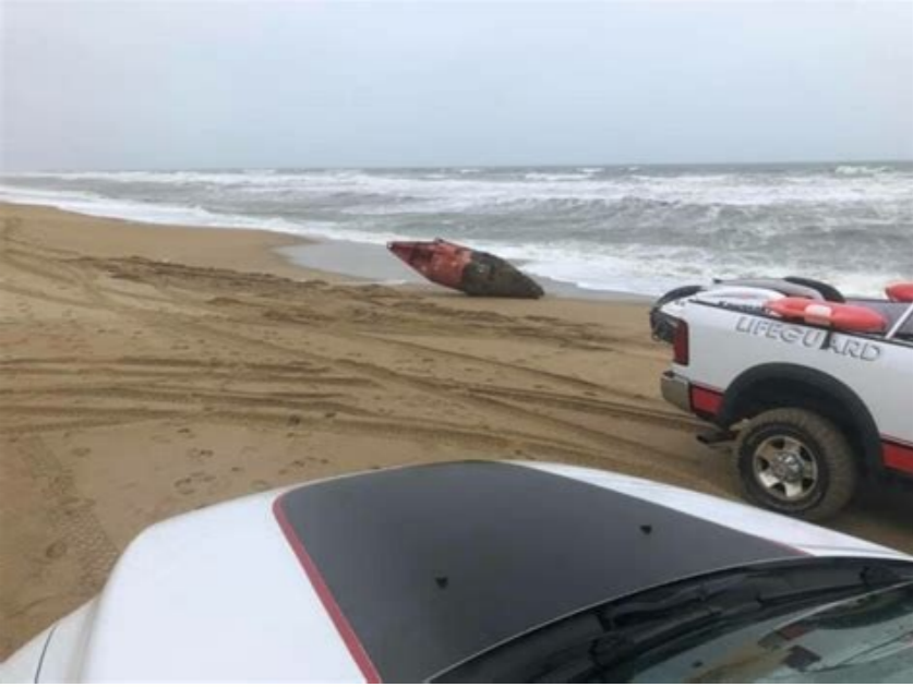
Surf fishing report kill devil hills nc.