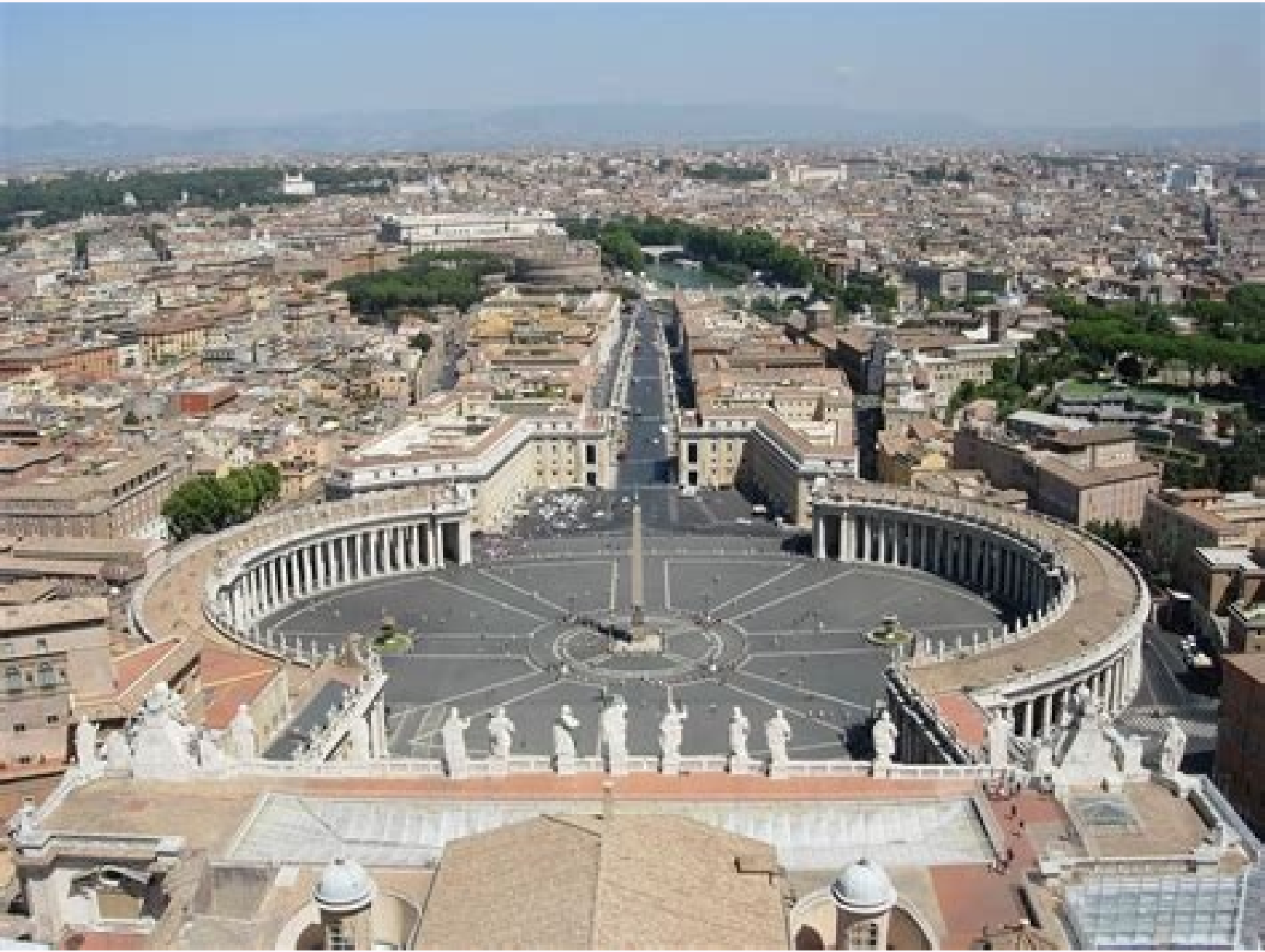
Using buses in rome. Big bus rome lines. How to get from rome to venice by high speed train. How to get from venice to rome by train. Are buses in rome free. Rome bus lines map.